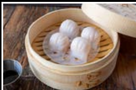
HAR GOW SHRIMP 4PCS | 8.50