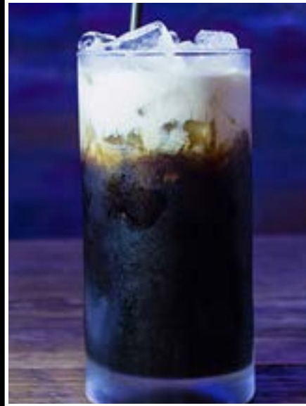
THAI ICED COFFEE | 4