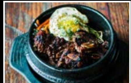
GALBI BIBIMBAP | 24

rice in hot stone pot with mixed vegetables, korean bbq short ribs & fried egg on top