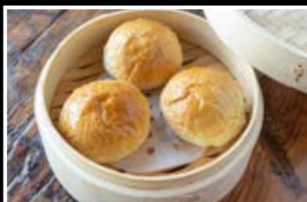
BAKED BBQ PORK BUNS 3BUNS | 8.50