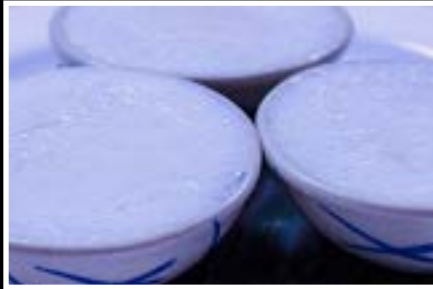
COCONUT CUSTARD | 7 coconut custard in a cup