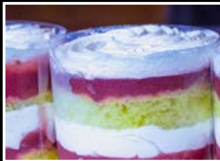
STRAWBERRY SHORT CAKE | 6