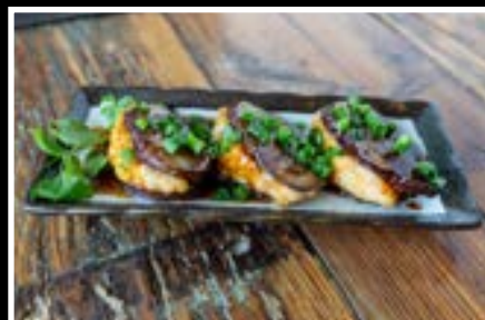
STUFFED SHRIMP EGGPLANT 3PCS | 8.50