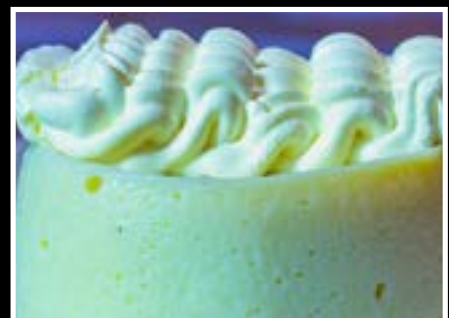
KEY LIME | 6