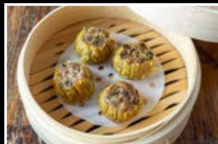
CHICKEN SHUMAI 4PCS | 8.50