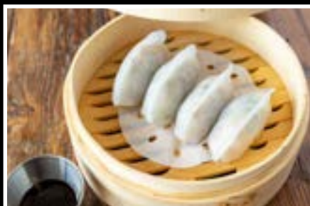
VEGETABLE DUMPLINGS 4PCS | 8.50