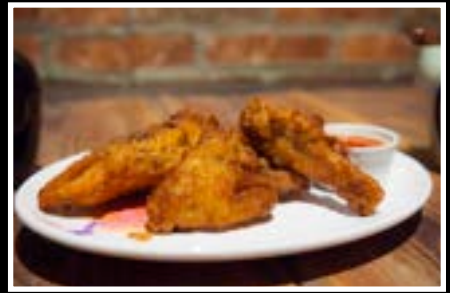
THAI FRIED CHICKEN | 9