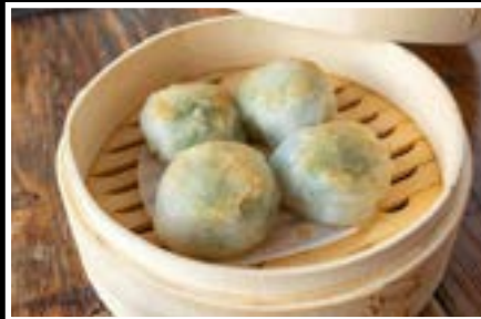
PAN FRIED CHIVE & SHRIMP 4PCS | 8.50