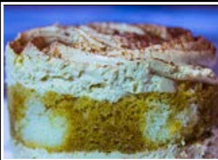
TIRAMISU | 6