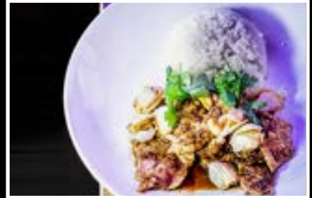
GARLIC CHICKEN OR PORK | 14

chicken, beef or pork shrimp | 11 mix | 13