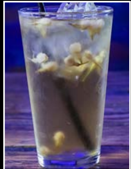
CHAMOMILE TEA | 3