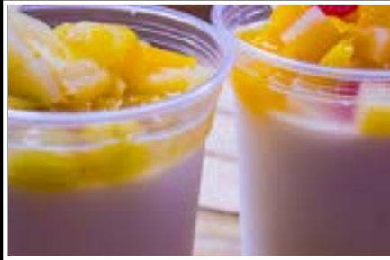
TOFU PUDDING | 7 with fruit toppings