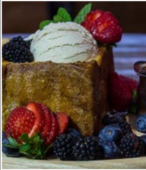
SHIBUYA HONEY TOAST | 10 vanilla ice cream with honey syrup & mixed fruits