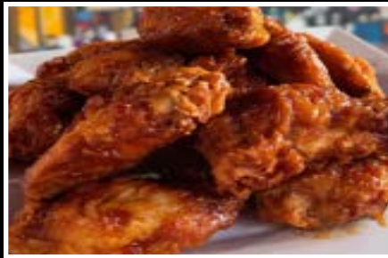
KOREAN FRIED CHICKEN 6PCS | 9 12PCS | 15