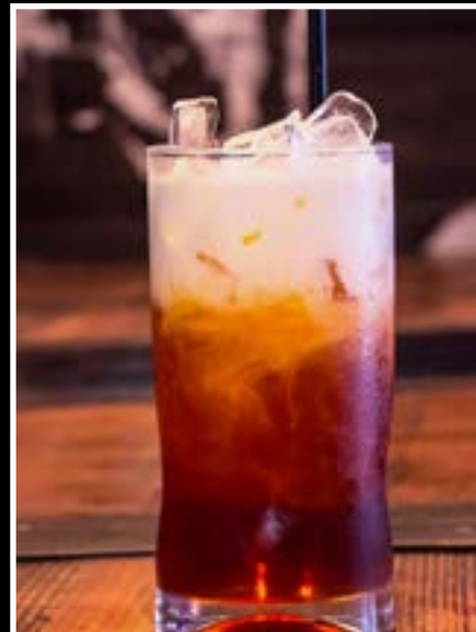
THAI ICE TEA | 5.25