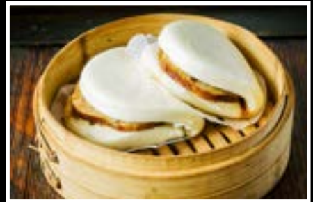
PORK BELLY BAO | 10