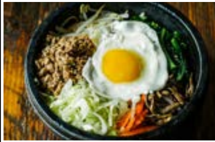
BIBIMBAP | 14

rice in a hot stone pot mixed with vegetables, beef & a fried egg on top