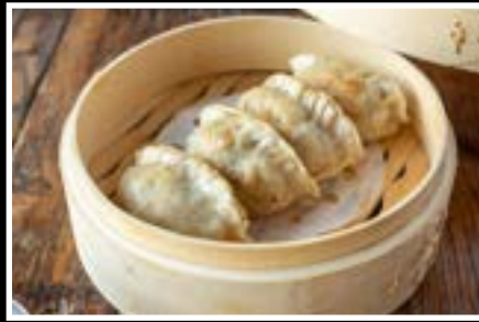
PAN FRIED PORK DUMPLINGS 6PCS | 12