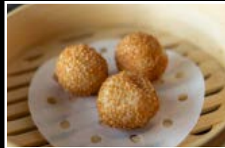
FRIED CRISP SESAME SEED BALLS 3PCS | 8.50