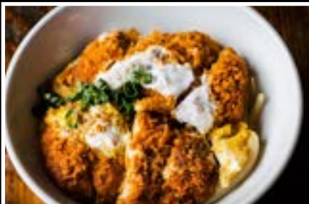
TONKATSU (PORK) | 14