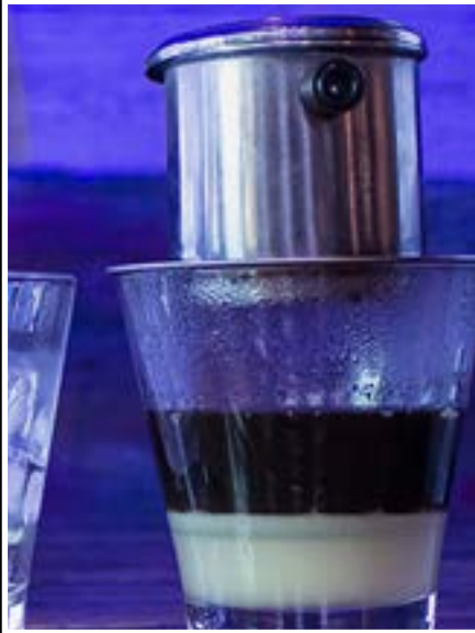
VIETNAMESE COFFEE | 4