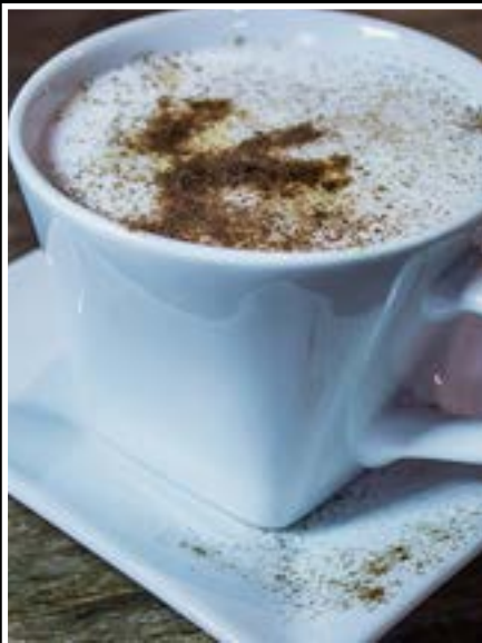
CAPUCCINO | 4