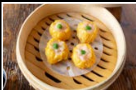
SHRIMP DUMPLINGS 4 PCS | 8.50