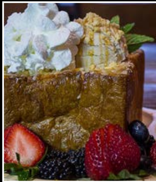
PARMESAN CARAMEL HONEY TOAST | 10 vanilla ice cream, caramel sauce, mixed fruit, crunchy peanuts with parmesan cheese