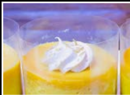
PASSION FRUIT CHEESE CAKE | 6