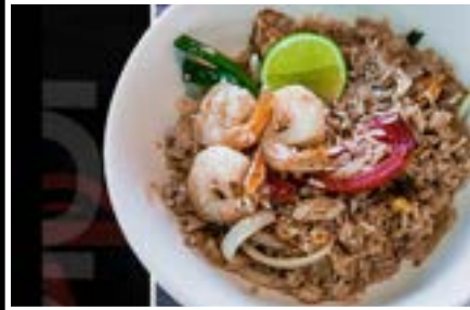
FRIED RICE | 10

rice in a hot stone pot mixed with vegetables, beef & a fried egg on top