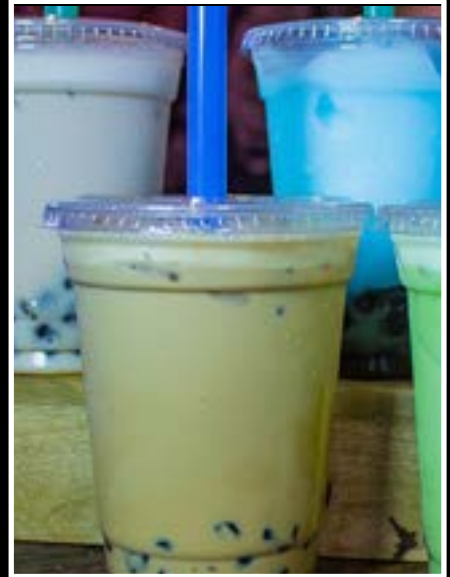
BUBBLE TEA | 4