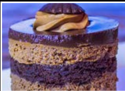
CHOCOLATE PANACHE | 6