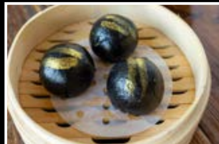
EGG CUSTARD BUN 3PCS | 8.50