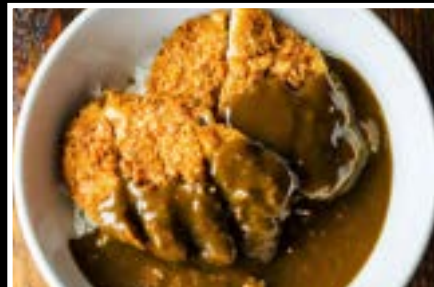
TONKATSU (PORK) CURRY | 14