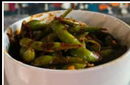
SPICY EDEMAME | 7