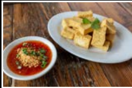
FRIED TOFU | 9