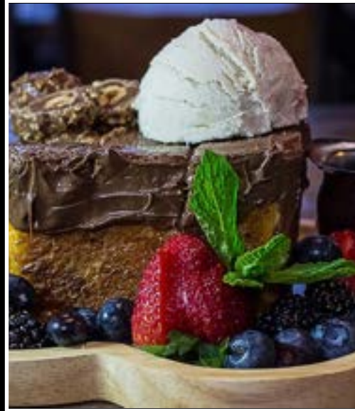
FERRERO HAZELNUT HONEY TOAST | 10 nutella hazelnut spread, vanilla ice cream, mixed fruit & ferrero rocher