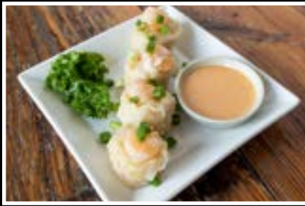
SHRIMP SHUMAI 4PCS | 9