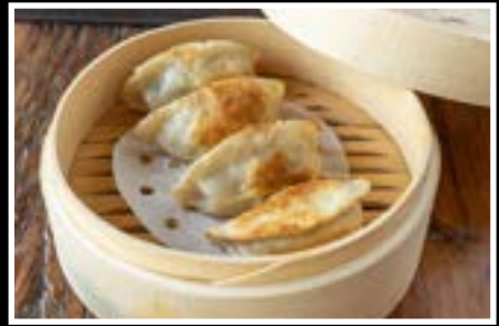
PAN FRIED CHICKEN DUMPLINGS 6PCS | 12