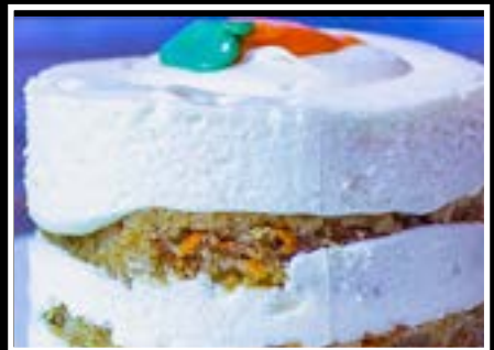
CARROT CAKE | 6