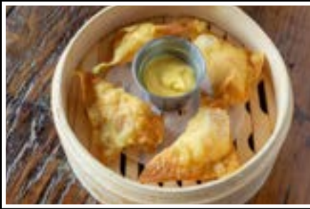
FRIED SHRIMP DUMPLINGS 4PCS | 8.50