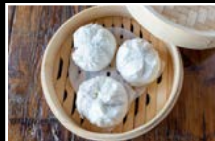
STEAMED BBQ PORK BUNS 3BUNS | 8.50