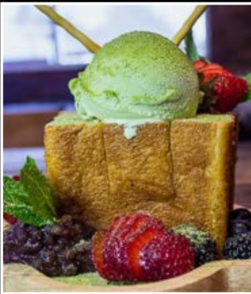
GREEN TEA HONEY TOAST | 10 green tea ice cream, honey syrup, red bean, mixed fruit & biscuit green tea