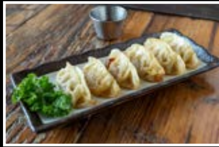
GYOZA 6PCS | 9